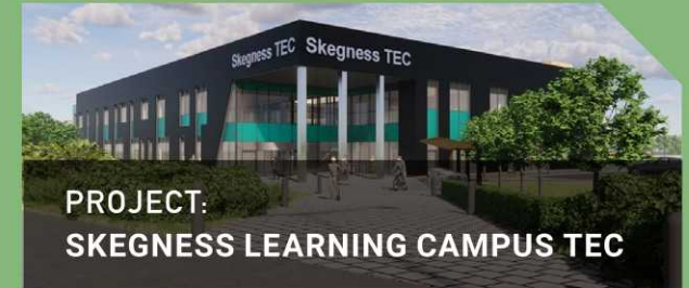
PROJECT: SKEGNESS LEARNING CAMPUS TEC