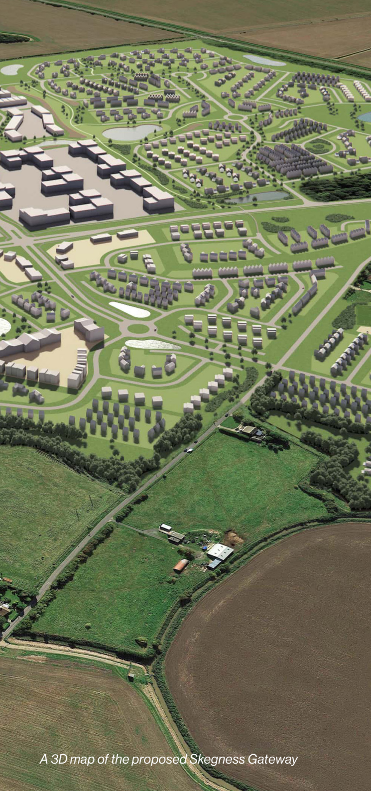
A 3D map of the proposed Skegness Gateway

Chief Executive, South & East Lincolnshire Councils Partnership