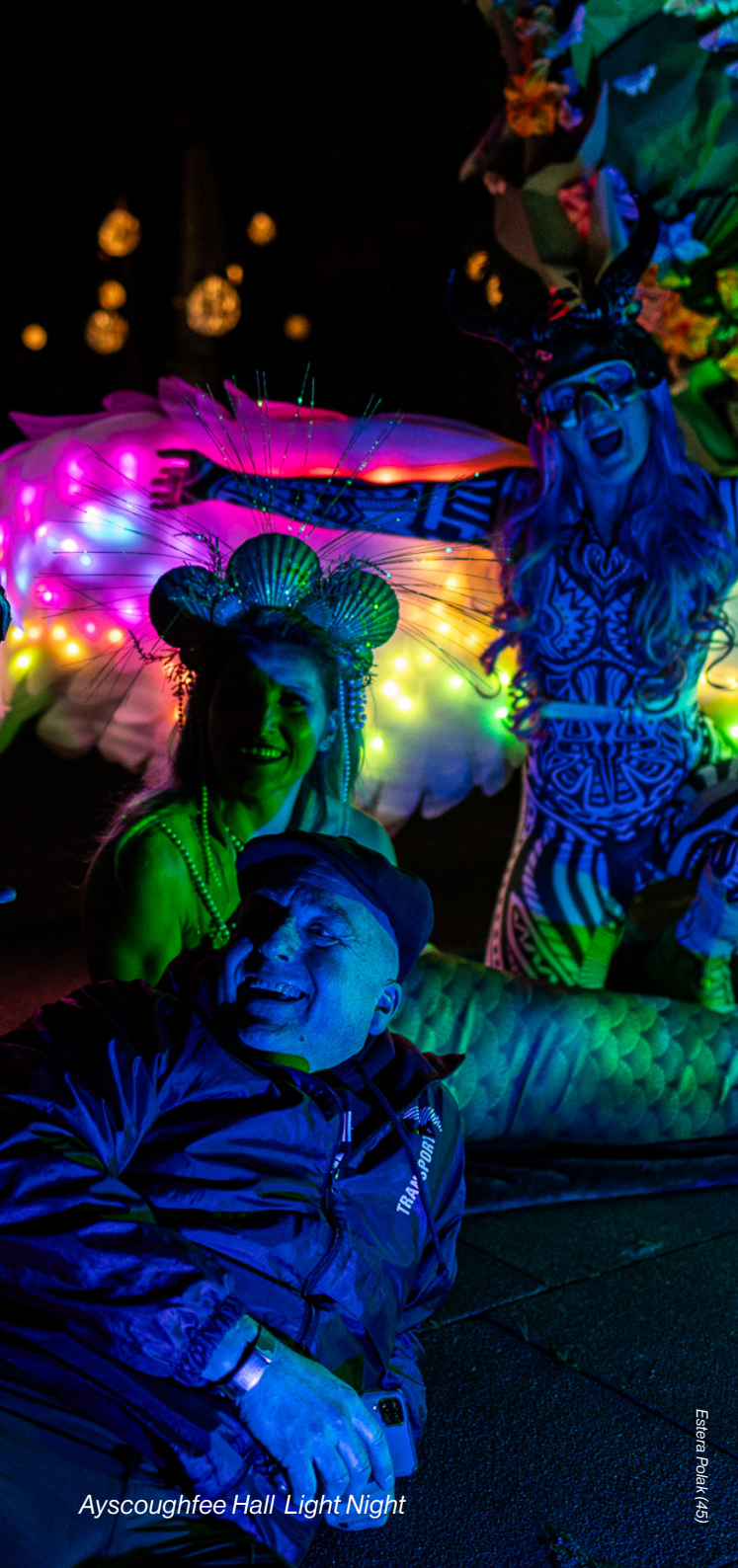
Ayscoughfee Hall Light Night